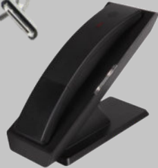
77 Mini Slim